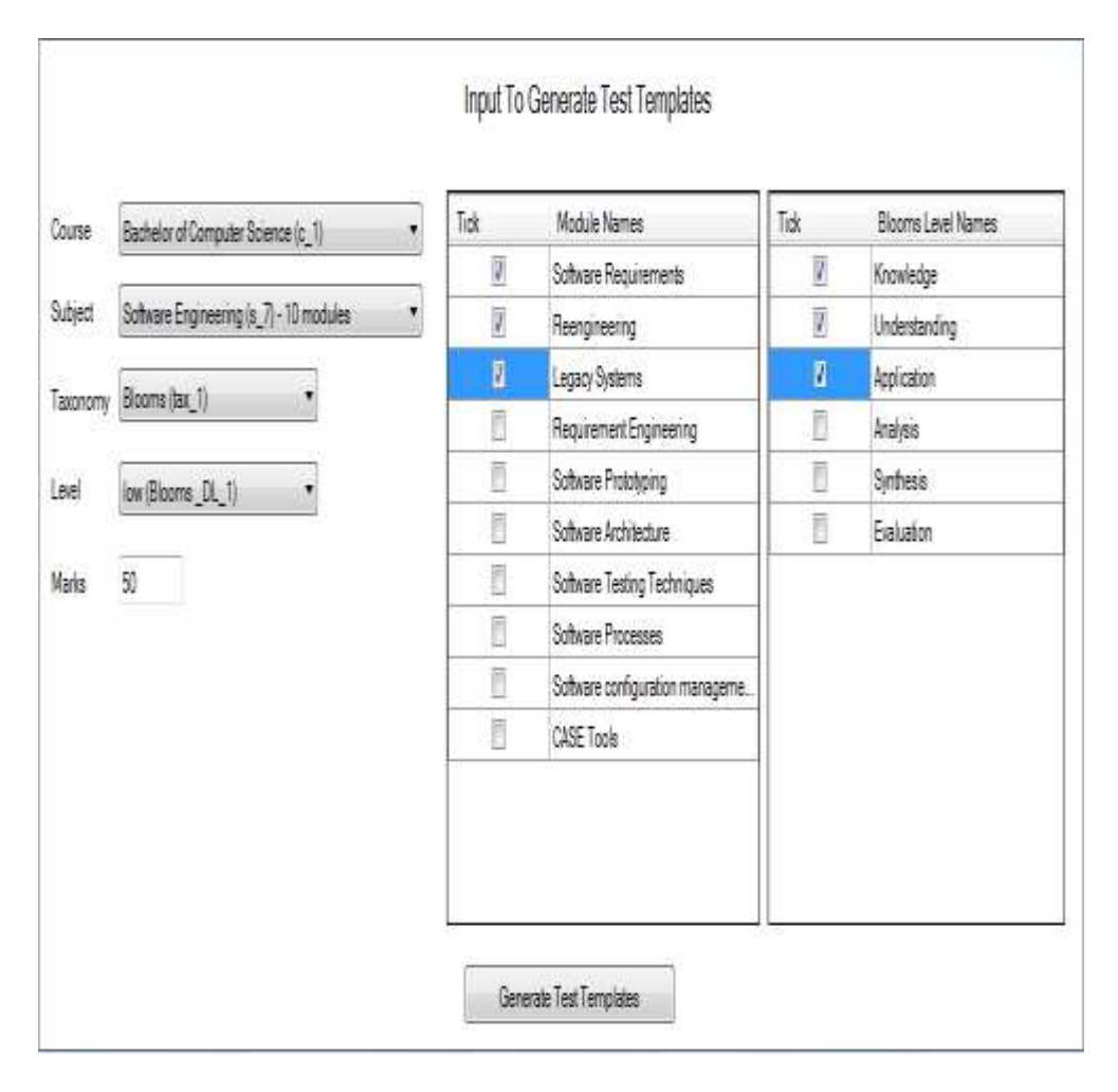
Figure 2. Question Paper Template Format