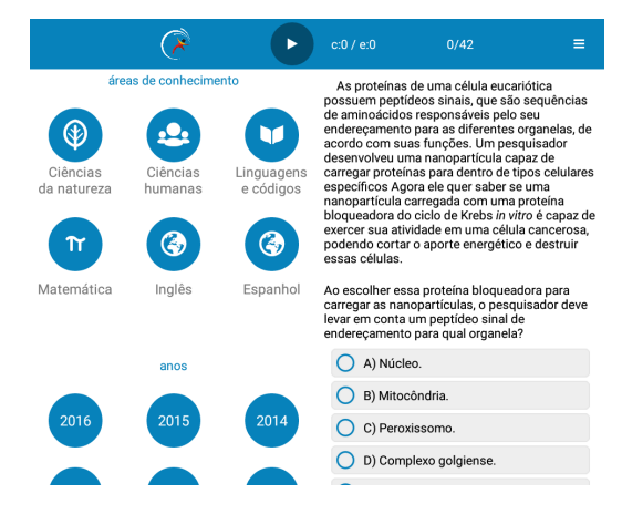
Figure 2: Questions of ENEM presented to the student.

The Figure 2 shows the questions of ENEM presented to the student.