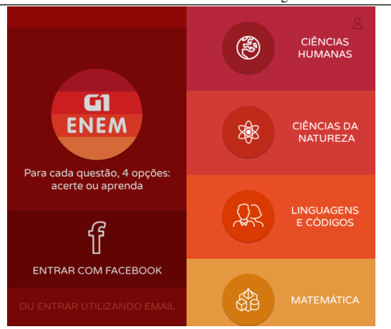
Figure 3: G1 ENEM.

One of the differences of this application is the collection of free classes, which makes it possible to study various contents of High School where and when you want the user can also schedule a schedule of studies in the application, Geekie Games was chosen to the official platform of the Program of the Enem and is the only study application to be recognized by the Ministry of Education. However just as the G1 ENEM Geekie Games relies on internet connection.